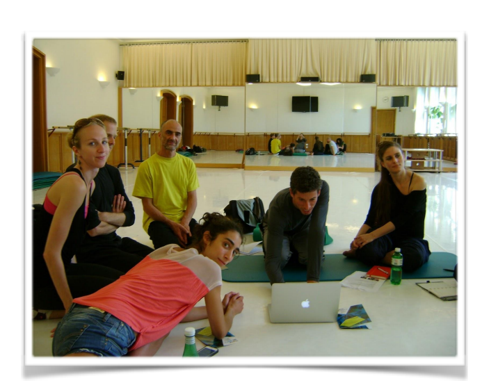
Photo: 2nd Swiss LEAP / IDOCDE meeting in Tanzbüro Basel, 7 Dec. 2014

information and application (free of charge): Andrea Boll: andrea.m.boll@gmail.com and Sonia Ntova: sonia.ntova@gmail.com (last minute pop in is possible)