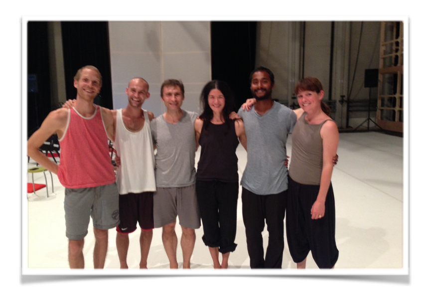
Photo: part of the Swiss crew at 2nd IDOCDE symposium during IMPULS Dance in Vienna, summer 2015

Photo: TR in CDC LE Pacifique Grenoble FRA